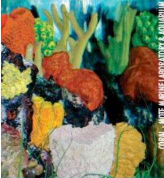
CORAL - MOTE MARINE LABORATORY & AQUARIUM