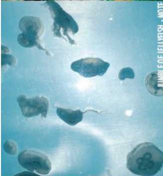
JUMBLE OF JELLYFISH - MOTE