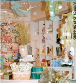
SHOPPING AT ST. ARMANDS