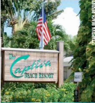
CAPTIVA BEACH RESORT