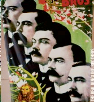
INSIDE CA'D ZAN - THE REAL RINGLING BROTHERS