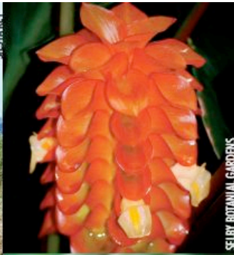
SELBY BOTANICAL GARDENS